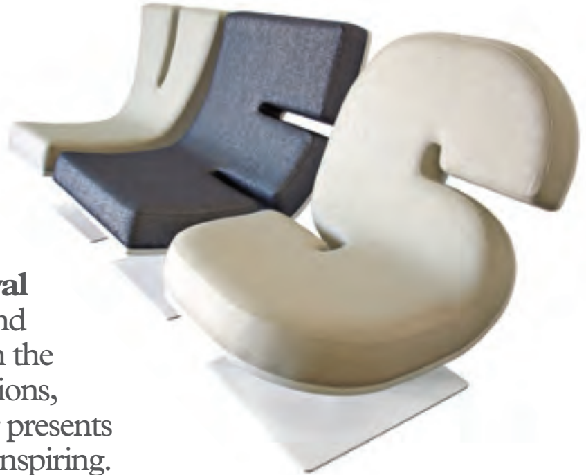
TABISSO TYPOGRAPHICAL FURNITURE www.tabisso.com

The ninth London Design Festival ran from 17-25 September 2011 and showcased more than 300 events in the shape of product launches, installations, exhibitions, tours and talks. Sleeper presents its pick of the most innovative and inspiring.