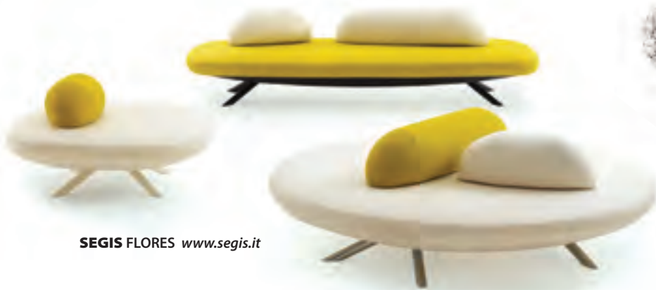
SEGIS FLORES www.segis.it