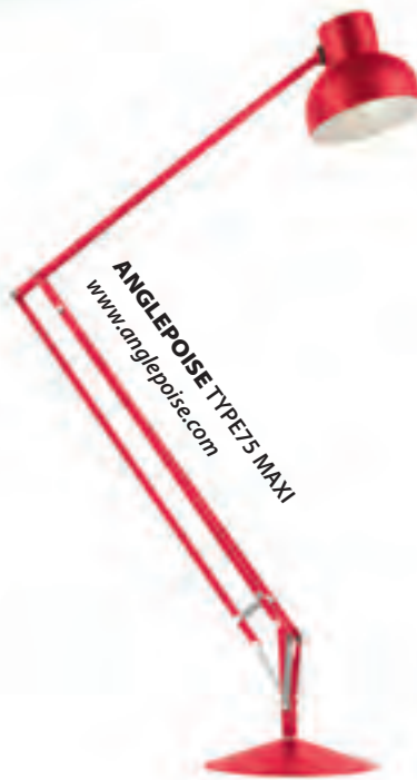
ANGLEPOISE TYPE75 MAXI www.anglepoise.com

Finally, in one of the most gastronomic events, Flos and Moroso hosted Galleria Illy to coincide with the launch of Marcel Wanders' Can Can Mini suspension lamp. The Dutch designer was on hand to make bespoke 'Marcel' cappuccinos with the help of expert baristas, while concept caterers Blanch & Shock served coffee flavoured surprises. ■ www.londondesignfestival.com