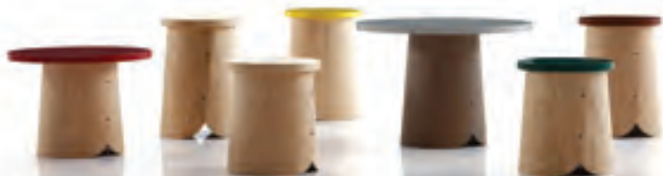
SANCAL TAB www.sancal.com