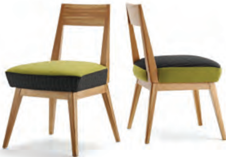
MORGAN FURNITURE LIMA www.morganfurniture.co.uk

W ith an audience of over 350,000 attending Festival events, and more than two million people experiencing large scale outdoor installations, the London Design Festival can now claim to be the world's biggest audience for a design event, with visitors from over 50 countries recorded.