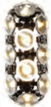
TABISSO TYPOGRAPHICAL FURNITURE www.tabisso.com